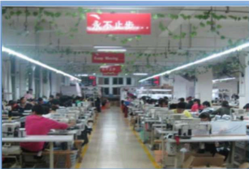
全自动吊挂流水车间